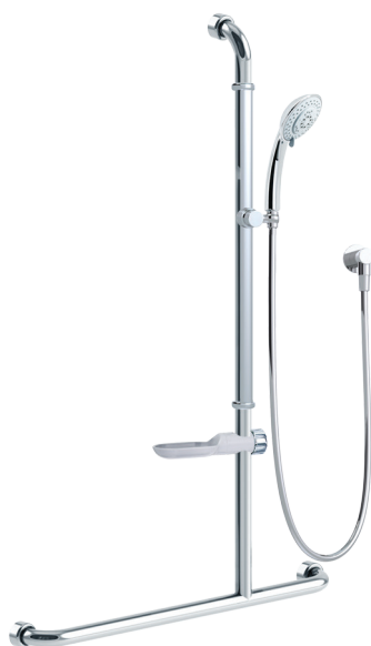
Drawn RH (Right Hand)